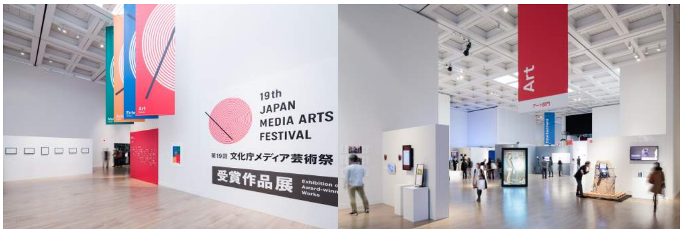
Exhibition of Award-winning Works / 19th Japan Media Arts Festival, 2016.

The festival received 4,034 entries from a record 88 countries and regions in its four divisions: Art, Entertainment, Animation, and Manga. Selected from these entries, award-winning works and Jury Selections will be presented at the Exhibition of Award-winning Works, along with materials documenting the lifetime accomplishments of Special Achievement Award winners. Significant works selected after a rigorous judging process along with a program of concurrent events will see diverse artists and creators gather, exemplifying the “here and now” of Media Arts.