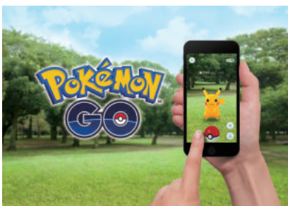
©2016 Niantic, Inc. ©2016 Pokémon. ©1995-2016 Nintendo/Creatures Inc. / GAME FREAK inc.

Film Screening Date and Time : Saturday, September 23, 14:00-16:00 Venue : TOHO CINEMAS Shinjuku