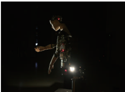
© 2016 Alter developed by Ishiguro Lab. in Osaka Univ. and Ikegami Lab. In Univ. Tokyo

Grand Prize Winner · Opening Talk Date and Time : Saturday, September 16, 12:30-13:30 Venue : NTT InterCommunication Center [ICC], Special Stage [4F]